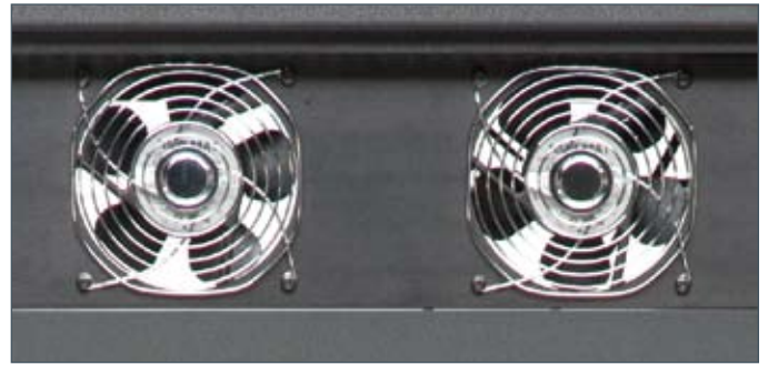
Fan detail shown

Foundations Component 500 and 100 Series racks were designed to support multiple add-on accessories, allowing you to create the perfect rack for your needs and AV system. 100 Series racks are pre-assembled and support select accessories for a more personalized solution. Component 500 Series rack frames come open and ready to customize for a unique rack tailor-made for your installation.