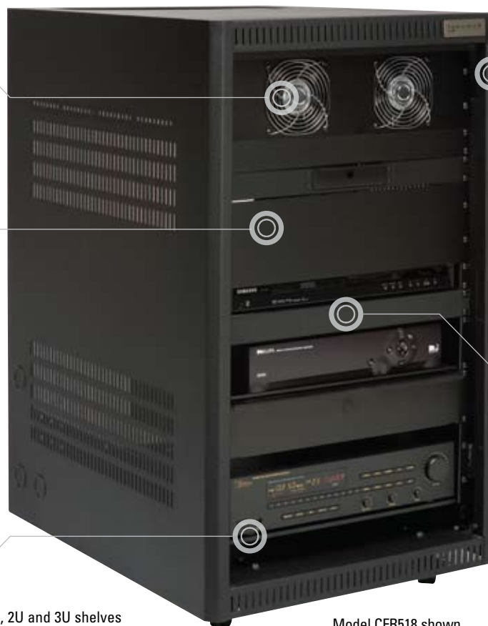
Model CFR518 shown

1U, 2U and 3U shelves support any combination of AV gear